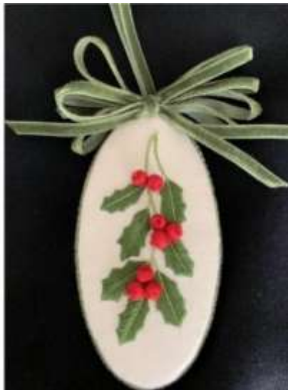
Project #1 1 Day Class, Kit $45

Please contact Jan Goss if you are interested in these classes janjgoss@gmail.com