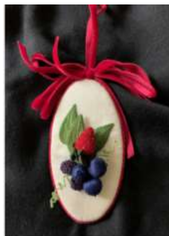
Project #5 2 Day Class, Kit cost $85