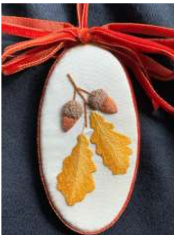
Project #4 1 Day Class, Kit $45