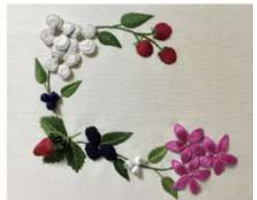
Project #6 2 Day Class Kit, cost $130