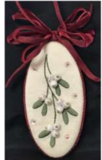
Project #3 1 Day Class, Kit $45