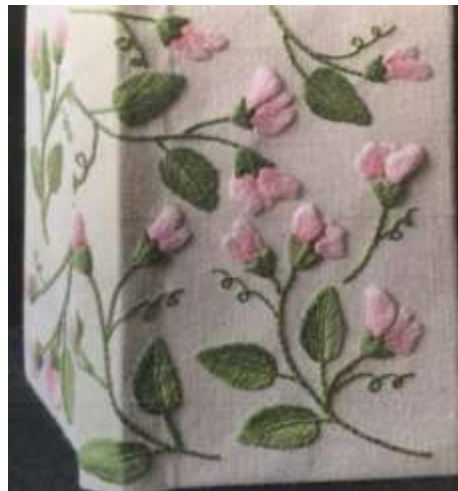
Project #2 2 Day Class Kit, cost $65