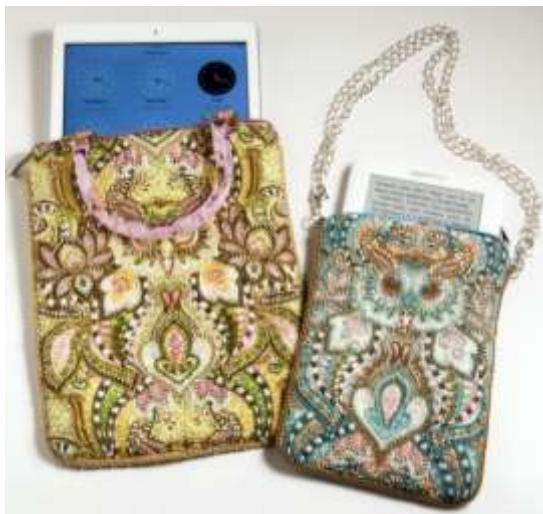
What-A-Hoot Carrying Case