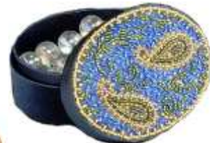
Prickly Paisley Eyeglass case or oval box Beginner Level