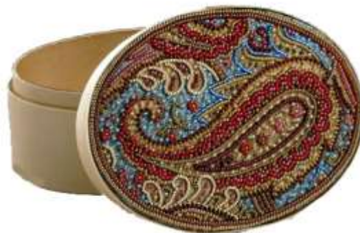
Paisley on Parade Box Advanced-Beginner Level