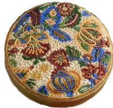
Floral Fantasy Box Advanced-Beginner Level

The lining fabric is a waterproof fabric. The backing fabric is made from a suede-cloth and trimmed with a golden waffle braid and constructed with a zipper closure. Finishing may be done commercially or by the individual.